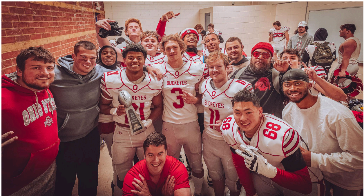
(Above) Ohio State's 2023 defense featured eight Honorable Mention All-Americans, including five defensive backs.