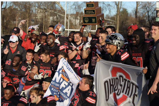
(Left) Ohio State defeated George Mason in the 2021 NCF A National Championship game. The win was part of a team-record 16-game winning streak.

W – OHIO STATE 69 @ Oakland 0 W – OHIO STATE 48 @ Wright State 0 W – Pittsburgh 0 @ OHIO STATE 2 (Forfeit) W – OHIO STATE 46 @ Ohio Northern (JV) 7 W – OHIO STATE 30 @ Denison (JV) 3 L – OHIO STATE 7 @ Wittenberg (JV) 27 W – Toledo 9 @ OHIO STATE 66 W – OHIO STATE 52 @ Michigan State 0^ W – Sacred Heart 9 vs. OHIO STATE 43* L – OHIO STATE 14 vs. Central GA Tech 29+ ^ - Great Lakes Conference Championship * - NCF A Semifinals +- NCF A National Championship Game